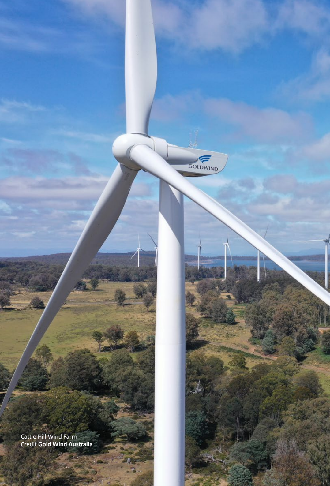
Cattle Hill Wind Farm